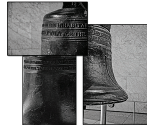
Photography and Design, Defense Logistics Agency Philadelphia, 2018