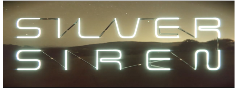
(left) "The Future is Old" branding, photography, design for luxury leather apparel; (top) Blender 3D title sequence for online series (below) street photojournalism sample